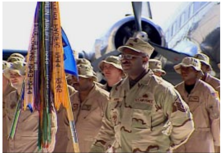
Airmen from the 41st Airlift Squadron stand in formation during the realignment ceremony Feb. 23 at Pope Air Force Base, N.C. The 41st AS "Blackcats" are heading to Little Rock AFB, Ark., as part of the Base Realignment and Closure process. The 41st AS will stand up at Little Rock AFB April 5.