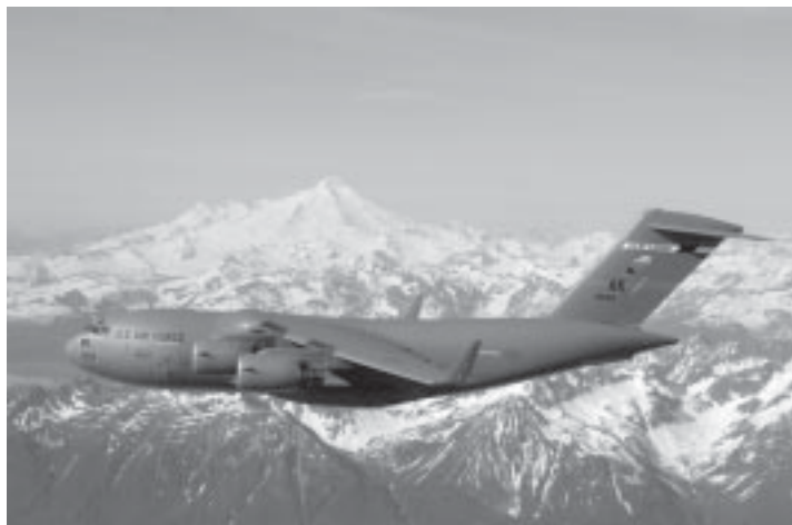
The first of eight C-17 Globemaster IIIs was delivered June 11 to Elmendorf Air Force Base, Alaska. This aircraft, named "Spirit of Denali," was piloted by two pilots and two loadmasters from the active duty Air Force and Alaska Air National Guard. The airlifter will be flown by the 517th Airlift Squadron and the 249th Airlift Squadron.