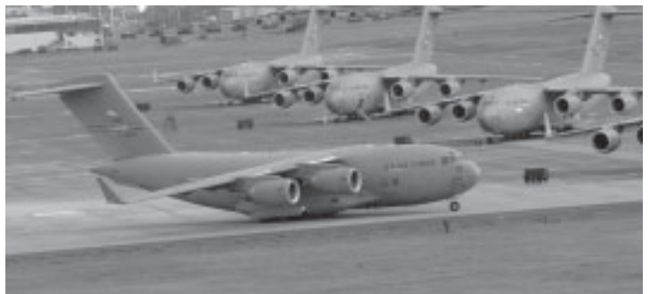
Dover Air Force Base, Del., will receive its first C-17 Globemaster III, similar to these shown here, on June 4. A specially selected aircrew traveled to Long Beach, Calif., to take delivery of "The Spirit of the Constitution" from the Boeing Company and fly it back to Dover.