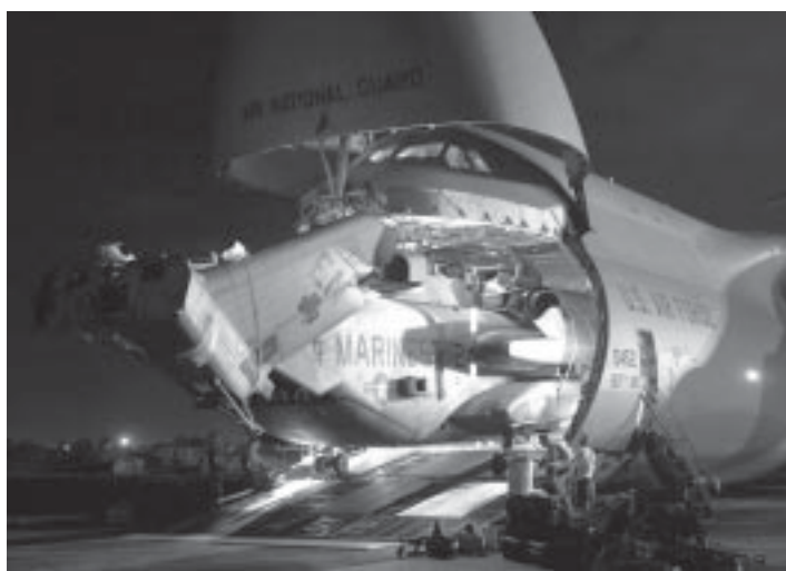
Crewmembers remove a Marine CH-53E Super Stallion helicopter from a C-5 Galaxy in Djibouti, Africa, April 10. The Galaxy's overseas journey was a first for the West Virginia Air National Guard's 167th Airlift Wing.