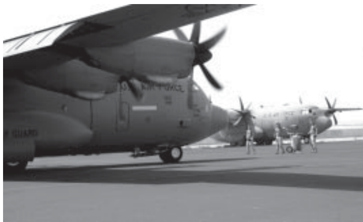
Two C-130 Hercules aircraft spin up for a mission June 2 at a base in Southwest Asia. Coalition C-130s and C-17 Globemaster IIIs flew 145 airlift sorties June 2 and delivered more than one million pounds of cargo. Airlift provided intra-theater heavy airlift support, helping to sustain operations throughout Afghanistan, Iraq and the Horn of Africa.