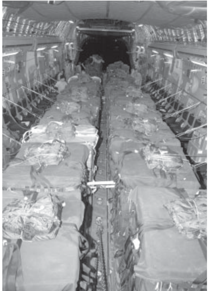
An 816th Expeditionary Airlift Squadron aircrew works with Army personnel in Afghanistan to rig a C-17 for an airdrop mission in February. The squadron has seen an increase in airdrop missions during its rotation.